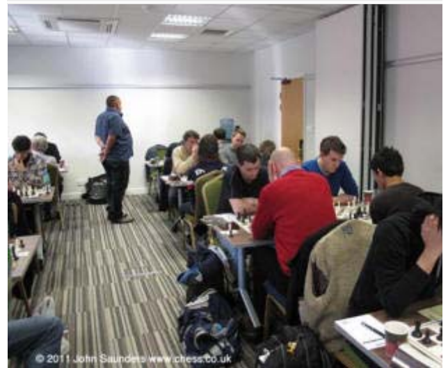
Div 2a: Bradford DCA Knights A (5-3) Cambridge University 2

The second weekend takes place on the 14th and 15th January 2012 with Divisions 1, 2 and 3 South taking place at the Barcelo Hotel, Hinckley Island with Division 3 North being held at De Vere, Wychwood Park, Crewe.