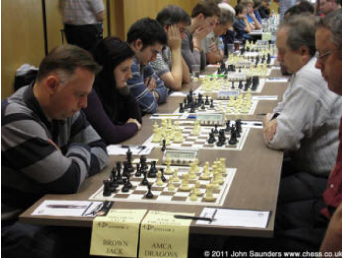
Section B Div 2: Brown Jack - AMCA Dragons