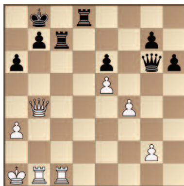
Round 8 Wood Green I - White Rose K.Arakhamia-Grant - P.Townsend

Black's extra pawn should tell in the long-term, but the game ends in surprising fashion. 35...♗dc8?! 35...♗f7, so that the queen can help in what should be a simple defence of the black king, was better. Now the white queen is allowed to become dangerously active. 36 ♗d6! Suddenly Black is tied up and the a6 pawn is also en prise . It's surprisingly hard to find a good move for Black here.