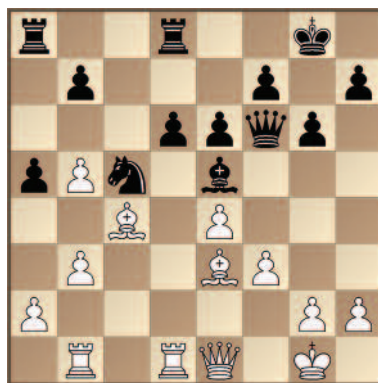
Round 4 The ADs - e2e4.org.uk J.Mestel - A.Slavin

The position is roughly level – White has the two bishops, but no obvious pawn breaks, while Black has an extra centre pawn and an excellent bishop on e5. Slavin makes an interesting decision and goes for a kingside attack. 20...g5!? 21 b6 Fixing the b7 pawn, a potential weakness on a light square in an endgame. Other normal moves, such as 21 ♖bc1 were possible. 21...g4 22 ♖e2 Defending the f3 pawn. 22...♗h8 23 ♗h1? Careless and perhaps losing his sense of danger. 23 ♖f1! , threatening f4 and forcing Black to clarify the situation on the g-file was much better. 23...♗h4! 24 f4 g3 24...♗xe4 was also good, with the idea 25 ♖c2 ♗xf4 26 ♗xf4 g3! winning back the piece. 25 h3 Black has won a safe pawn. 25...♗xf4 26 ♖f1 It was probably better to seek salvation in the opposite bishop position after 26 ♗xc5 , though it won't be much fun for White, especially with his bad king. 26...♗xe3 27 ♖xe3 ♖xe4 28 ♖d2? 28 ♖c3+ offered some saving chances, for example 28...♖e5 29 ♖xe5+ dxe5 30 ♖be1 e4 31 ♖xf7 when Black is still better but has a lot of work to do. 28...♖g6 Now Black is simply two pawns up and Slavin converted easily on move 40... 0-1